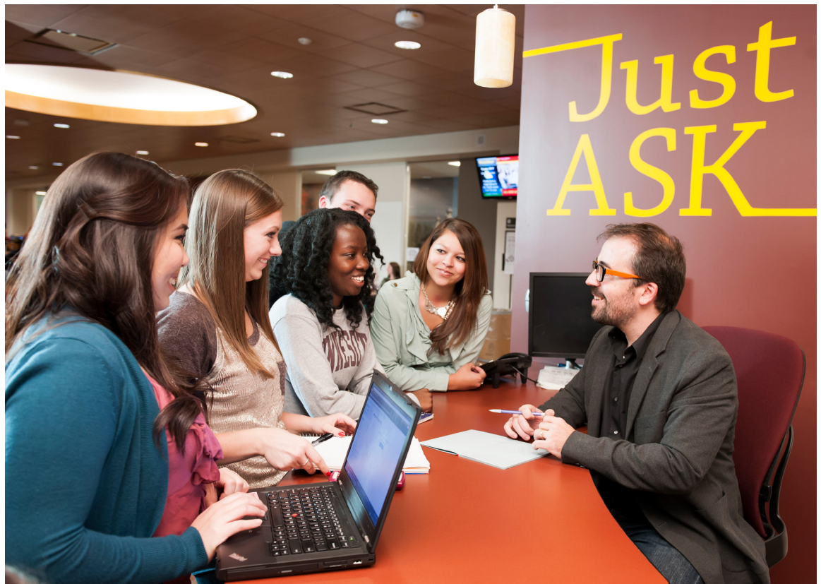
The U. of Minnesota at Rochester offers four “JustASK” centers staffed by an interdisciplinary team of faculty members to advise students who may be too intimidated to go to a professor’s office.